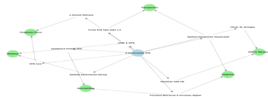
Figure 2. Contribution of E-Government to Bureaucratic Reform

E-Government makes a significant contribution to bureaucratic reform by accelerating the transformation of governance to become more transparent, efficient, accountable and responsive (Dwiyanto, 2022). Through the digitalization of public services, the integration of information systems, and the use of technologies such as open data portals, online licensing systems, and public complaint applications, e-Government minimizes cumbersome bureaucratic practices and opens up wider space for public participation (Lathifah et al., 2024). In West Nusa Tenggara Province, various initiatives such as NTB Satu Data, NTB Care, and SPBE have become important instruments in strengthening the performance of the apparatus, increasing public trust, and building a bureaucracy that is adaptive to current developments.