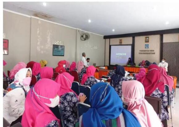
Image 2. Sosialisasi KB Pria melalui pertemuan IMP