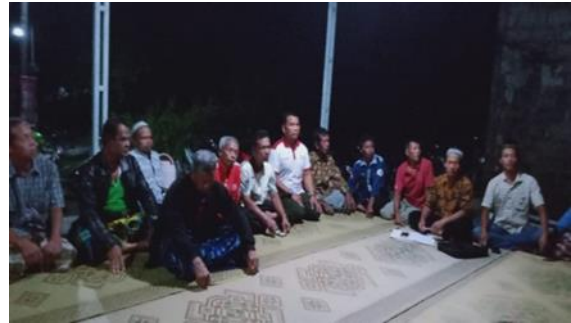
Image 1. Socialization of male family planning at the padukuhan level 2023

Based on the results of the interview, it was found that the comparison of postoperative MOW is longer than MOP, and there is a greater risk in female contraception. (Nina Sri, S.ST. 2023) explains, MOP is a safe procedure and is only done once to provide permanent results so that it facilitates birth control. This procedure is also relatively simple with a relatively short postoperative recovery time compared to female sterilization. However, in the first three months after MOP, it is advisable to use a condom because there are still sperm remaining in the channel to the outside that can come out with semen.