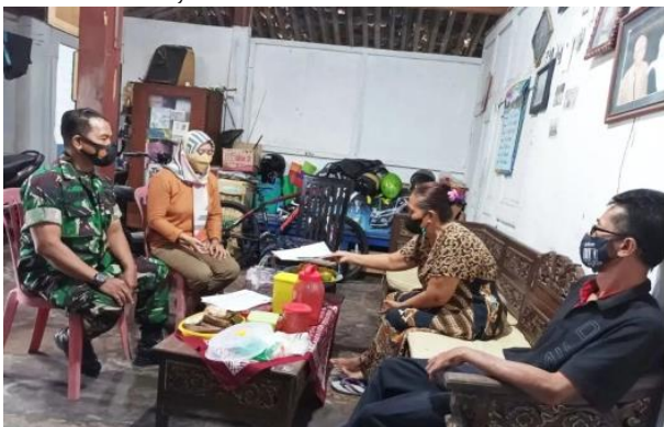
Image 4. Providing IEC to prospective MOP acceptors