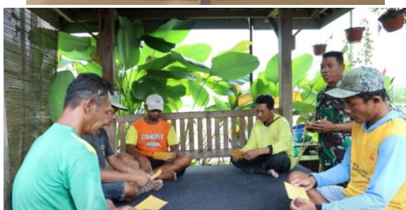
Image 5. Motivator activity using intimate cards

Source: Profile of Male Family Planning Groups Widodomartani Village 2023