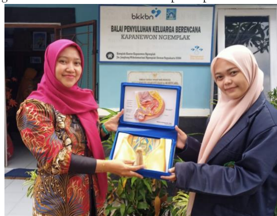
Image 6. KIE KIT Tool

such as the use of educational media in the form of KIE KT, as well as the delivery of information through Myth and Fact Cards about MOP. Participants in this activity come from the general public, especially men of childbearing age. Although socialization has been carried out routinely and with various approaches, until now the MOP program in Widodomartani Village has not shown a significant increase in the number of participants.