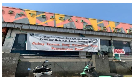
Figure 1. Advocacy Conducted by the Association

However, in practice, this training has been largely conducted through associations or trader representatives. The department acknowledged that limited resources have prevented them from reaching all business owners directly. This approach creates disparities at the business level. Many traders reported never having participated in training or received direct government assistance. Representation mechanisms through associations are considered ineffective in ensuring equitable access to information and development programs.